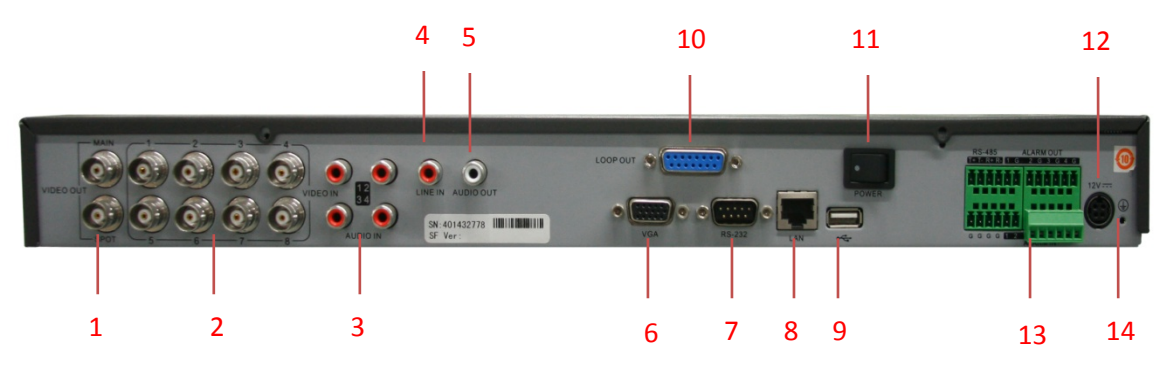
Figure 5. ST-DVR08LA4 Rear Panel